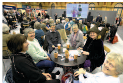
Taking a break with a free 'London Cuppa'

Coach & Tour operators can benefit from bringing their key clients along for a day out at Excursions. Feedback has shown that exposure to a large number of attractions and destinations has resulted in a substantial amount of new business being generated for the coach operator. If that's not enough to tempt you, as an added incentive, a VIP welcome with complimentary refreshments on arrival is also provided for pre-booked coach parties of group organisers.