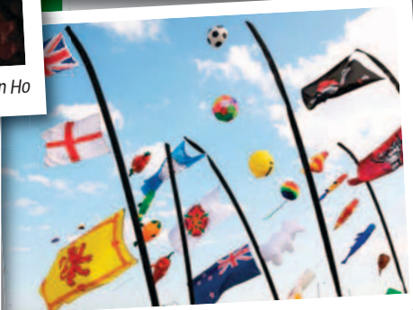
Basingstoke International Kite Festival