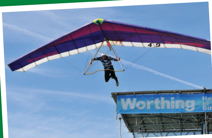
International Birdman Festival

You can find out about all these festivals and many more by visiting www.southeastengland.com/festivals