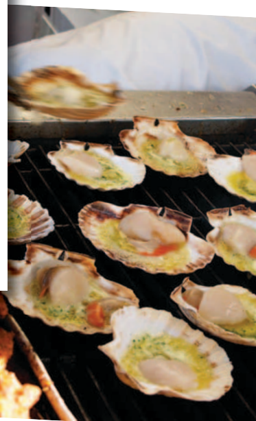
Hastings Seafood and Wine Festival