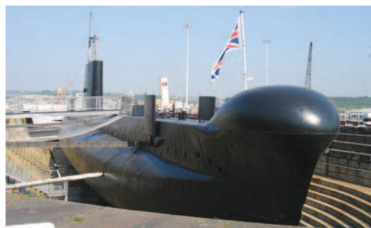
HMS Ocelot - Historic Dockyard Chatham

Heading further along the coast to West Sussex, a visit to Tangmere Military Aviation Museum is a must. The old RAF Tangmere airfield houses priceless historic aircraft such as Neville Duke's world record breaking Hawker Hunter, and a full sized replica of the Spitfire prototype. You can even try your hand at flying in a flight simulator!