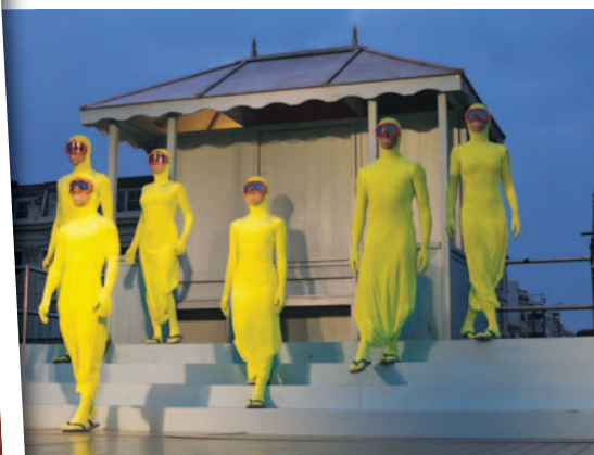
The Brighton Festival