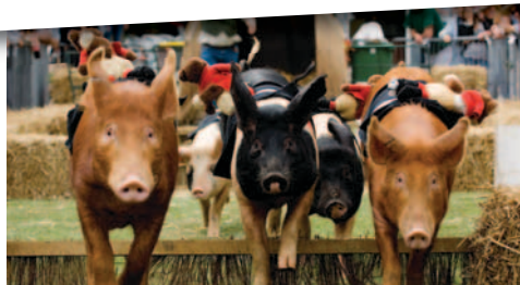
Surrey County Show