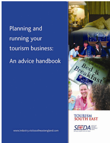
Business Advice Handbook B&B / Self-Catering / Combined