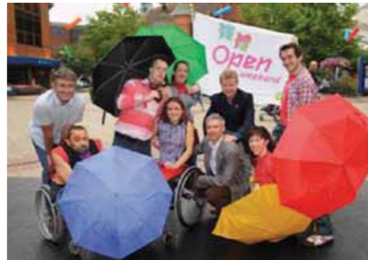
Lord Colin Moynihan and Jonathan Edwards meet StopGAP at Woking Dance Festival

The Cultural Olympiad is a series of events to showcase the UK's arts and culture to the rest of the world. It was launched in September 2008 around the Beijing Olympic and Paralympic Handover Days. Over 90 events took place in a region-wide celebration of creativity and sport through community festivals, flag-raising events, ceremonial relays, picnics and performances.