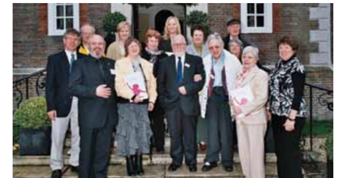
Visit Kent launch the Kent Greeters Programme

as a key event in the build up to 2012 and in 2009 over 18,000 tickets were offered free by 140 attractions. Work also began on the planning for the Dickens 2012 Festival to celebrate the bicentenary of the birth of one of Britain's most iconic literary figures.