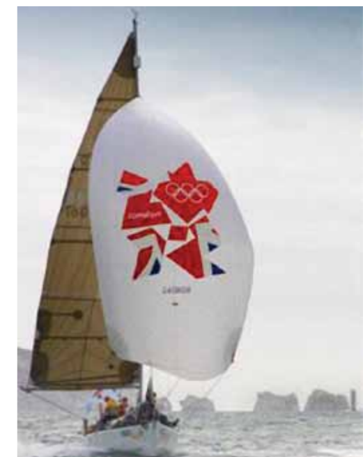
Isle of Wight flies the Olympic Flag for the Open Weekend.

The Solent consortium was encompassed within the PUSH initiative for Hampshire and started planning for activity to maximise the impact of the Olympic and Paralympic sailing events taking place at Weymouth. The first project was to work on establishing baseline research to inform the preparation of a strategy for realising the opportunities presented primarily by sailing events. On the Isle of Wight preparation for the 2011 Island Games began including sourcing accommodation and facilities for the expected 3000 participants and launching a local PR campaign to get the island community involved in volunteering and sponsorship.