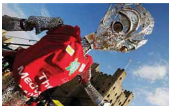
The Medway Champion Puppet – part of Imagination our Nation

Kent – has already secured its own EU Interreg funding for a 'Greet the World 2012' programme to boost its Greeters programme and the Big Day Out. It will also be undertaking Destination Access Audits in Canterbury, Dover, Tunbridge Wells and Medway. The Dickens Festival in 2012 will have a major focus in the county but will spread across London and down to Portsmouth too.