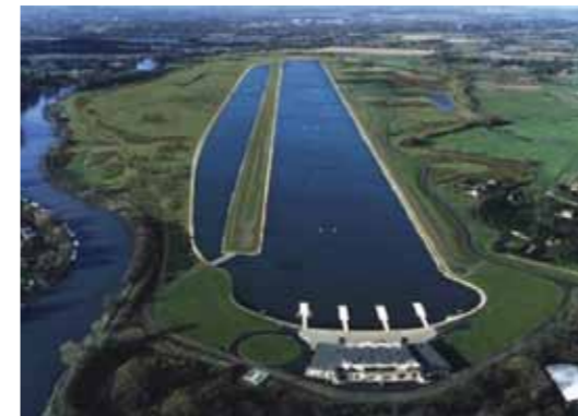
Eton Dorney Rowing Lake

Eton Dorney – as the venue for the rowing and flat water canoeing, Eton Dorney established eight sector groups locally to cover a range of relevant topics. In particular, it became a focus for the Hosting the World Customer Care programme staging the official launch in November, 2008. It also undertook some significant research on the expected economic impact of hosting the Olympic and Paralympic events at Dorney Lakes. Windsor and Maidenhead also became one of the first 2012 areas to undertake a Destination Access Audit. The Meetings, Incentives, Conference and Events (MICE) market has been specifically targeted with the production of a Venues Directory and familiarisation trips with potential buyers from Russia, Ukraine, Italy, Germany, Belgium and Qatar. Windsor also became a member of VisitLondon's Heathrow Gateway project.