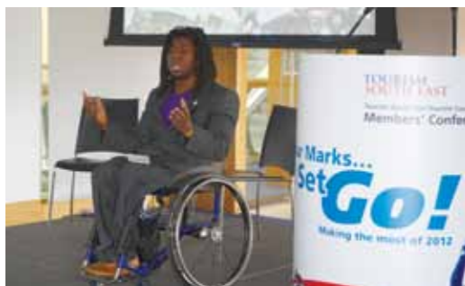
Paralympian Ade Adepitan Launches the On Your Marks Strategy in 2008

The Strategy established that the South East region stands to benefit from an extra £1b over the period 2008-2016 and identified a number of key programmes for Games Related and/or Games Motivated activities. Since then, Tourism South East, SEEDA and partners have put in place a number of programmes to create a world class region and to secure a legacy that lasts long after the Games are over. These have focused on Global Image and Awareness, Customer Service, Sports Events and Pre Games Training Camps, Accessibility, Quality and support for developing plans in specific Games Related Areas. In parallel, the Cultural Olympiad has played an important part in developing innovative and creative community events inspired by the Games.