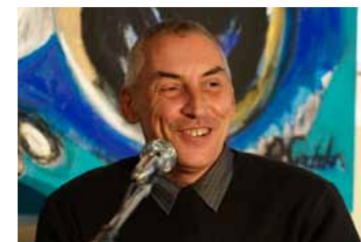
Peter Norfolk Paralympic Gold Medalist champions accessibility

www.industry.visitsoutheastengland.com/site/skills-and-training/training-projects