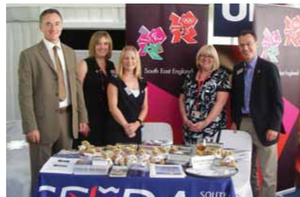
Team South East promote the region at Beijing 2008

representatives from the National Olympic Committees (NOCs) in order to increase the region's exposure internationally in readiness for the London 2012 Games. Subsequently, working with tourism specialist China Holidays, Tourism South East has been showcasing the South East as a quality holiday and business travel destination to the Chinese and Asia-Pacific markets. This has been achieved through press work, a Chinese website, exhibitions and major events, resulting in valuable familiarisation visits by press and tour operators to the region.