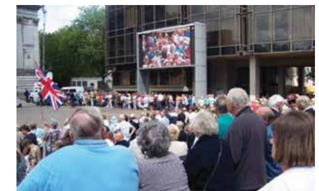
Portsmouth's Vibrant Live Site

www.london-2012.co.uk/2012-Training-Camps