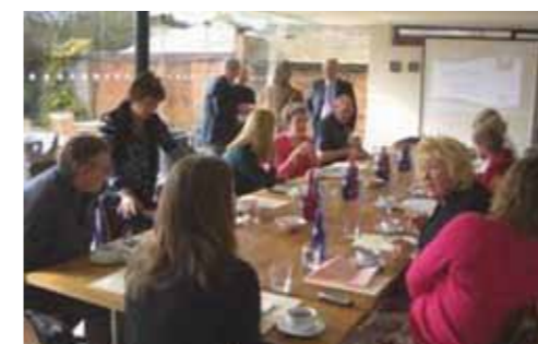
Businesses enjoy Quality Training session

The new suite of Hosting the World courses will be rolled out across the South East during 2010 and 2011. Aimed at owners, proprietors, supervisors and managers within the tourism, hospitality and leisure